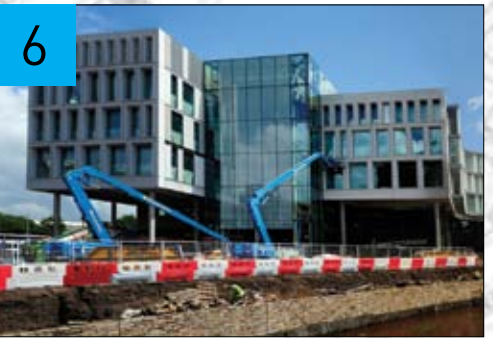
6 Number One Riverside New Customer Service Centre, library & high-quality offices 2011 - 2012 £50m