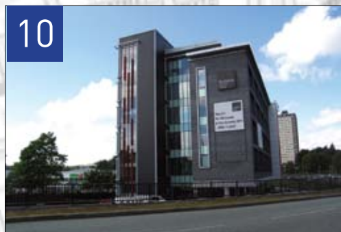
10 Rochdale Sixth Form College State of the art new education facilities £21m