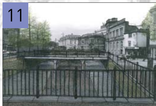
11 River Re-opening Re-opening parts of the River Roch, revealing historic bridges 2013 - 2015 £3.3m