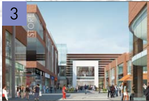
3 Town Centre East New retail and leisure development including a hotel, cinema and department store £100m