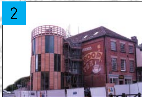
2 Rochdale Pioneers Museum Extension to Toad Lane Museum UN International Year of Co-operatives 2012 £2.3m