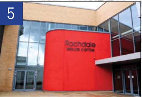
5 Rochdale Leisure Centre New pool and leisure development £11m