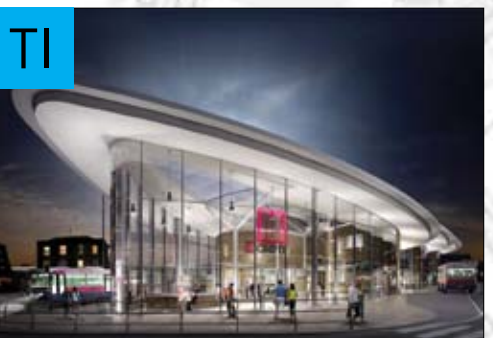
TI Transport Interchange New bus station, taxi rank and cycle facilities 2012 - 2013 £11.5m