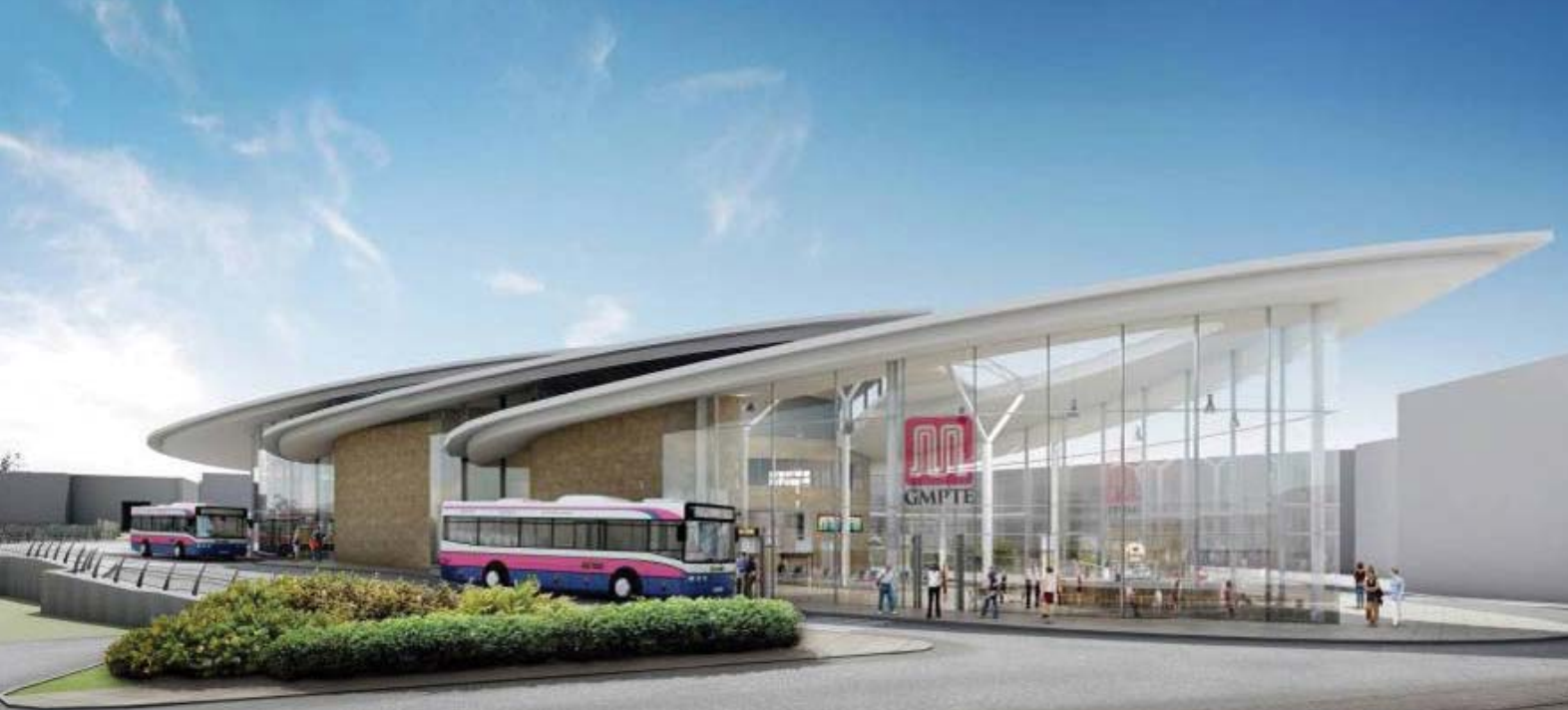
3D 'bird's eye view' of the proposed new shopping and leisure development