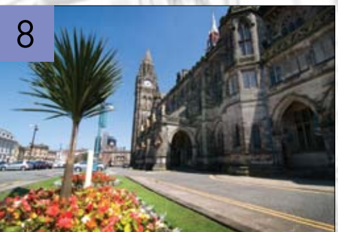
8 Rochdale Town Hall & Square Re-use of the Grade I listed town hall and redevelopment of the square 2013-2016