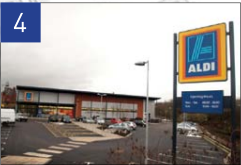
4 ALDI Store Rochdale 16,000 sq ft new food retail development next to the town centre £2m