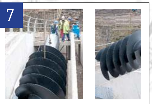
7 Hydro-power Scheme Utilising the River Roch to generate power. The 1st town centre hydro scheme in the UK £350,000